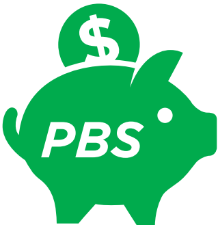
OVER $130M IN ANNUAL BIOSIMILAR SALES