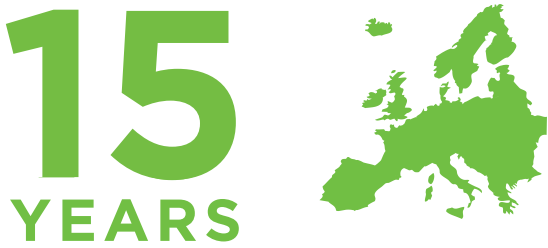
15 YEARS EUROPEAN EXPERIENCE