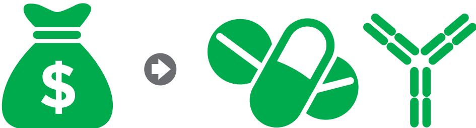
OVER $200M IN ANNUAL PBS SAVINGS DELIVERED FROM BIOSIMILARS THAT CAN BE INVESTED INTO NEW INNOVATIVE MEDICINES