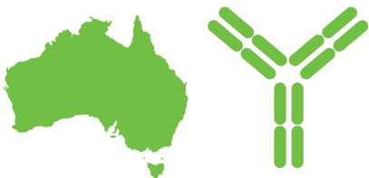
FIRST BIOSIMILAR IN AUSTRALIA IN 2010