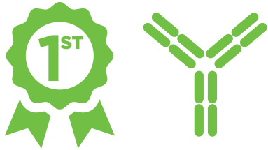
FIRST BIOSIMILAR APPROVED IN EUROPE 2006