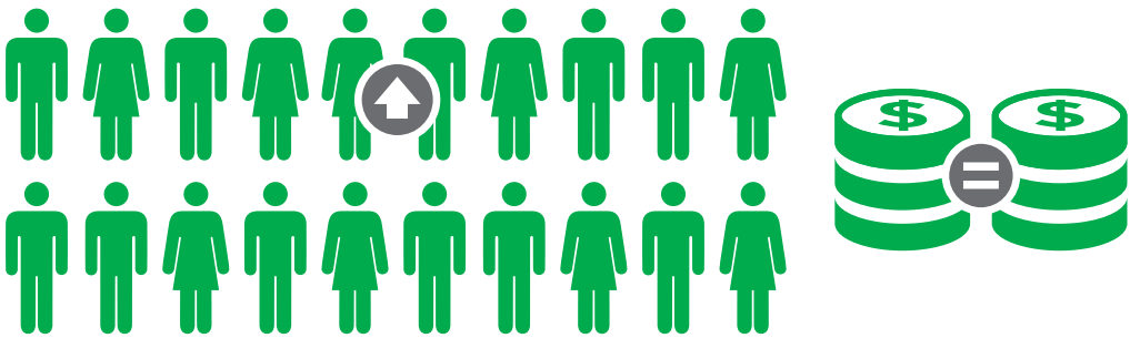
IMPROVED PATIENT ACCESS TO LIFE CHANGING MEDICINES MORE PATIENTS TREATED FOR THE SAME COST