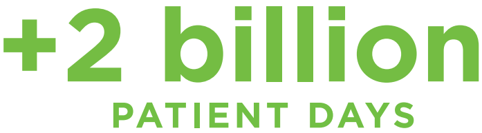
OVER 2 BILLION PATIENT DAYS IN EUROPE 1