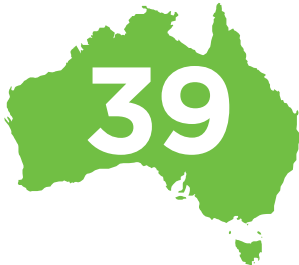
39 BIOSIMILARS LAUNCHED IN AUSTRALIA 2